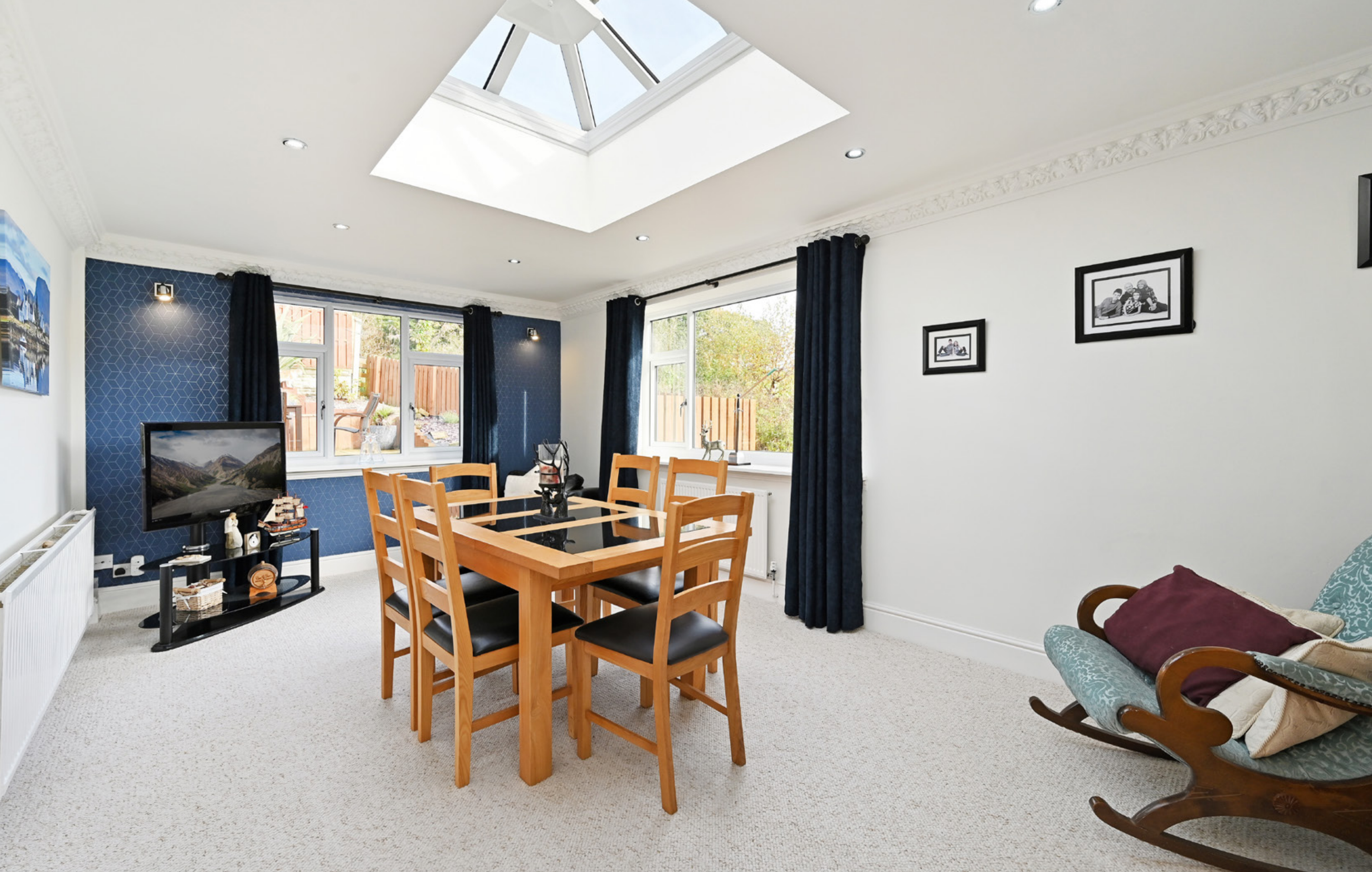
RECEPTION ROOM 1